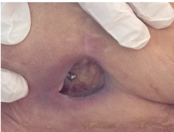
Figure 2. Impaired wound healing after gluteal abscess under pazopanib and later axitinib treatment for metastatic renal cell cancer. Osteosynthesis material of the hip after surgery for fracture because metastasis is visible.

The past decade has been one of major importance for cancer therapy with TKIs, as many milestones have been reached in the development of targeted cancer therapies along with monoclonal antibodies. Although TKIs are well established in the treatment of solid tumors, such as renal cell carcinoma, melanoma, or GIST, their efficacy for other solid tumors still remains dubious. The future of TKIs remains challenging in terms of combination regimes, optimizing dosing, or broadening of the